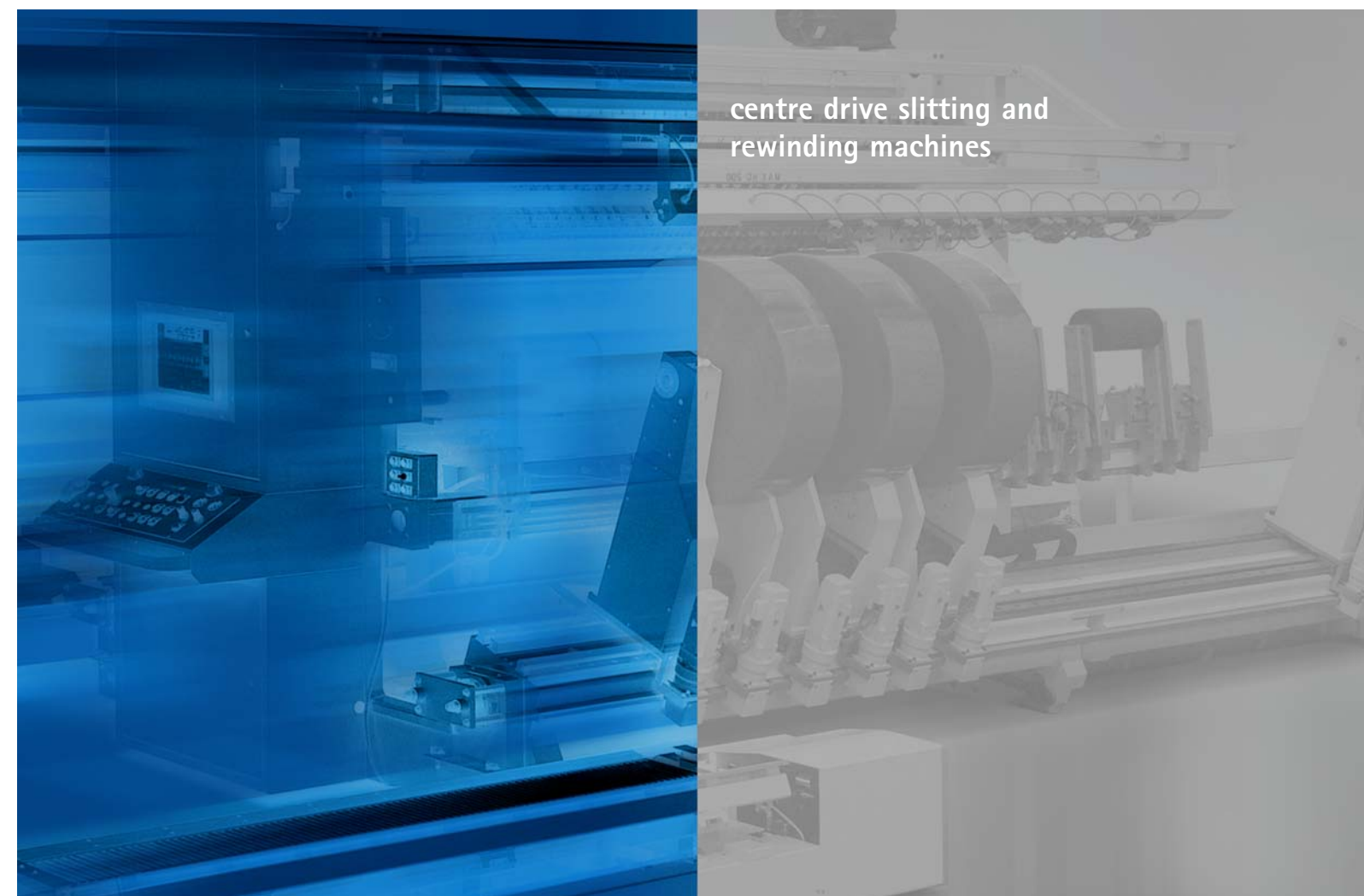
centre drive slitting and rewinding machines