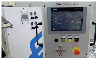
Main operating panel.